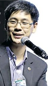
National Economic and Development Authority Acting Secretary Karl Chua said the Corporate Recovery and Tax Incentives for Enterprises Act will provide one of the country's largest stimulus measures for micro, small and medium enterprises.